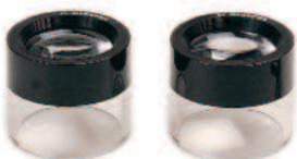
57554 3x 45mm / 1.75"

Acrylic lens with cylindrical plastic housing