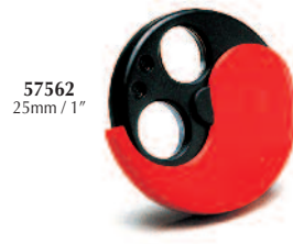
57562 25mm / 1"

PMMA lens. 8 separate magnifications grouped (5x, 10x) (6x, 11x) (7x, 12x) (8x, 9x)