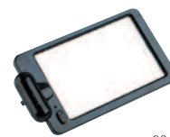
57590 2x / 90x55mm / 3.5x2.2"

Plastic lens with plastic frame and case