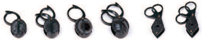
57051 5x single 25mm / 1"