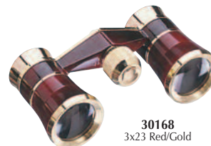
30168 3x23 Red/Gold

Galilean Optic. Beautifully crafted with 24 carat gold plating and available in three finishes, Opticon opera glasses are manufactured to a high specification making them both a pleasure to own and use. All models supplied in soft presentation case.