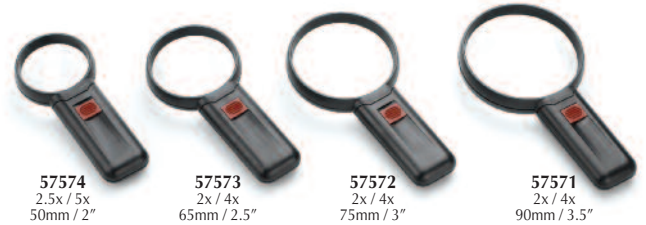
57574 2.5x / 5x / 50mm / 2" 57573 2x / 4x / 65mm / 2.5" 57572 2x / 4x / 75mm / 3" 57571 2x / 4x / 90mm / 3.5"

(Models use 2xAA 1.5V batteries. Not included)