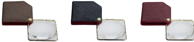
51451 3x 63mm / 2.5" Brown

Glass lens in gold plated frame with leather case