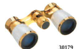
30179 3x23 Mother of Pearl/Gold