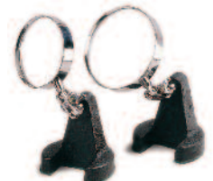
56502 3x 65mm / 2.5"

PMMA lens with chrome plated frame, 3-way head and metal base