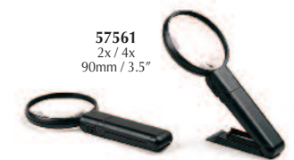
57561 2x / 4x / 90mm / 3.5"

Hard plastic lens, frame and handle with integrated stand