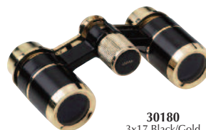
30180 3x17 Black/Gold