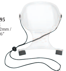
58595 2x / 115x152mm / 4.5x6"

PMMA lens with plastic frame and cord loop