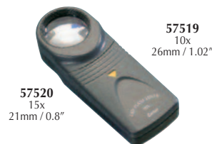
57520 15x / 21mm / 0.8" 57519 10x / 26mm / 1.02"

(Uses 3xAAA 1.5V batteries. Not included)