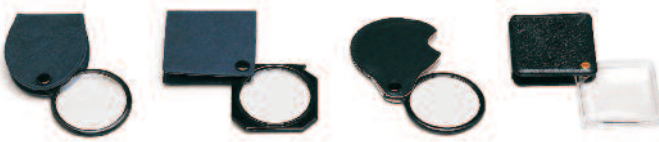
57501 3.5x 45mm / 1.8" Blue