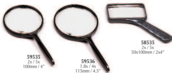
59535 2x / 5x / 100mm / 4" 59536 1.8x / 4x / 115mm / 4.5" 58535 2x / 5x / 50x100mm / 2x4"