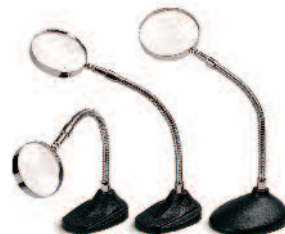
56554 2x / 5x 90mm / 3.5"

PMMA lens with chrome plated frame, metal base and 300mm/12" flexible arm