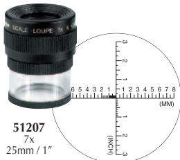
51207 7x 25mm / 1"

4 element glass lens with focusing. 0.6" and 16mm scale