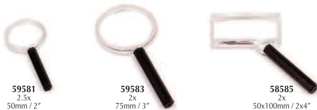
59581 2.5x / 50mm / 2" 59583 2x / 75mm / 3" 58585 2x / 50x100mm / 2x4"

PMMA lens and frame with hexagonal plastic handle