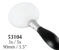
53104 3x / 5x / 90mm / 3.5"

(Uses 2xAAA 1.5V batteries. Not included)