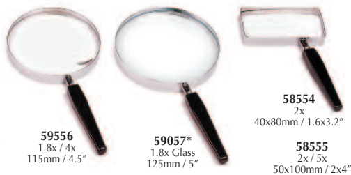
59556 1.8x / 4x / 115mm / 4.5" 59057* 1.8x Glass / 125mm / 5" 58554 2x / 40x80mm / 1.6x3.2" 58555 2x / 5x / 50x100mm / 2x4"