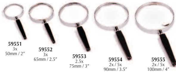
59551 3x / 50mm / 2" 59552 3x / 65mm / 2.5" 59553 2.5x / 75mm / 3" 59554 2x / 5x / 90mm / 3.5" 59555 2x / 5x / 100mm / 4"

PMMA lens* with metal frame and tapered handle