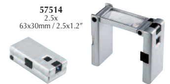
57514 2.5x / 63x30mm / 2.5x1.2"

(Uses 3xAAA 1.5V batteries. Not included)