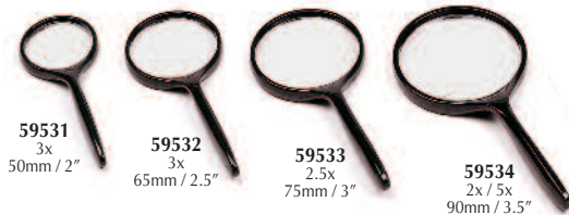
59531 3x / 50mm / 2" 59532 3x / 65mm / 2.5" 59533 2.5x / 75mm / 3" 59534 2x / 5x / 90mm / 3.5"

PMMA lens with black plastic frame and handle